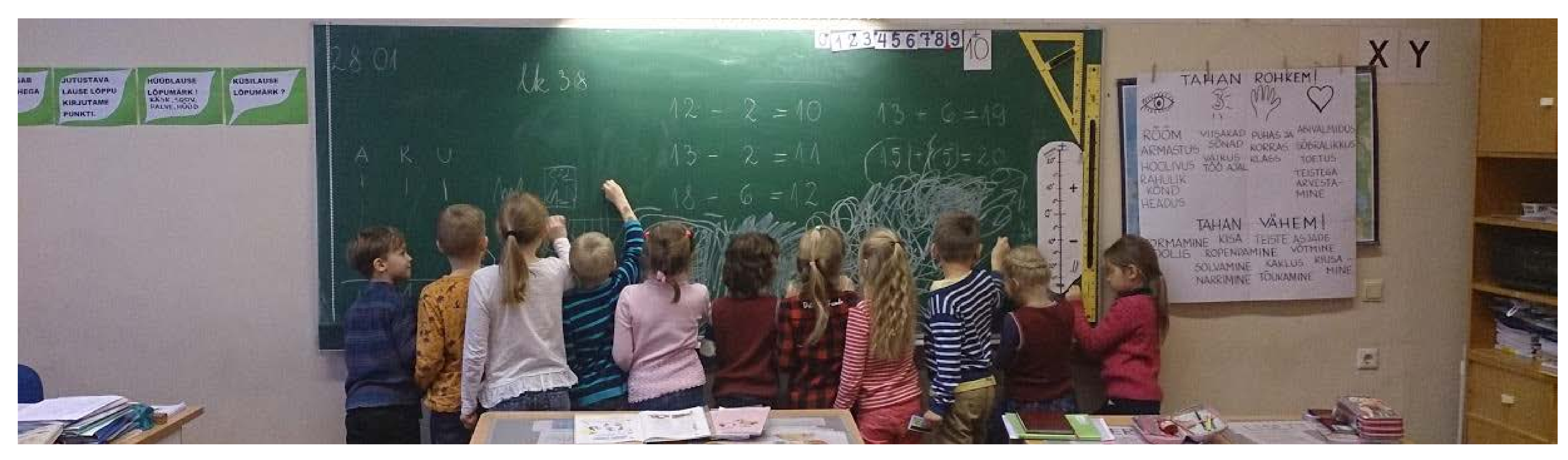
Figure 1. Students have received intrinsic motivator as a reward for cooperative behaviour and can scribble on the chalkboard